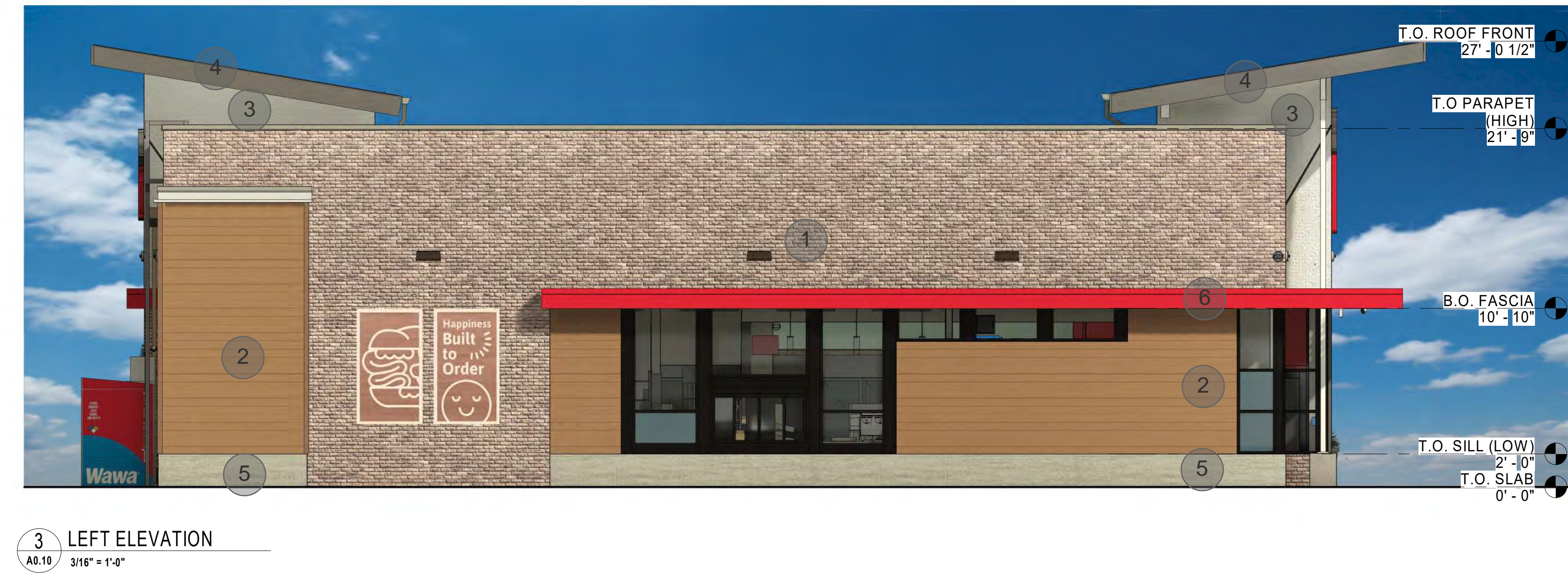
3 LEFT ELEVATION A0.10 3/16\"/>

NOTE: PLANTERS AND SEATING ARE NOT STANDARD, INCLUDE ONLY PER SITE SPECIFIC REQUIREMENTS